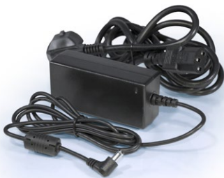
Power supply unit