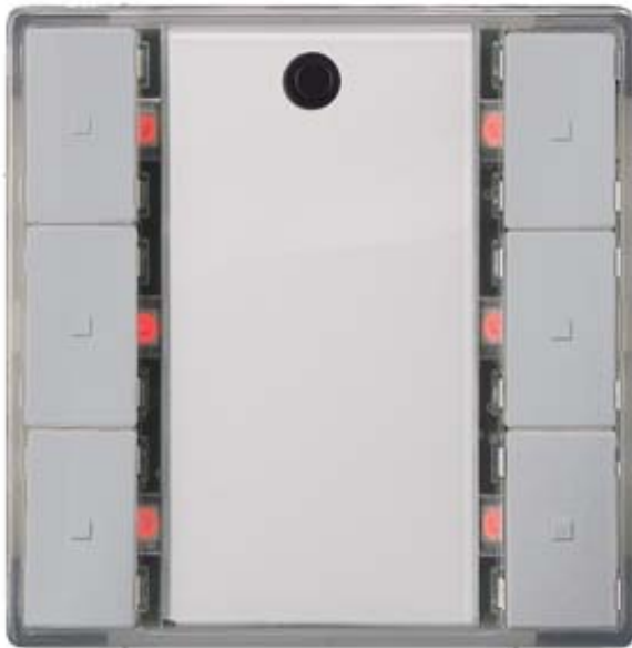
GAMMA INSTABUS WALL SWITCH TRIPLE, WITH LED AND IR RECEIVER UP 223/5 DELTA I-SYSTEM ALUMINIUM METALLIC