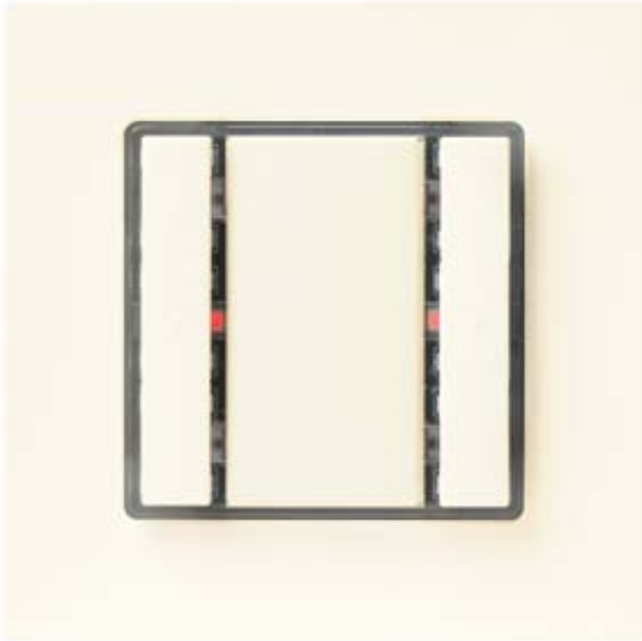
GAMMA INSTABUS WALL SWITCH SINGLE, WITH LED UP 221/3 DELTA I-SYSTEM TITANIUM WHITE